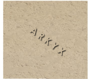
CONCHA NACAR CREAM